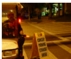
Parking & traffic