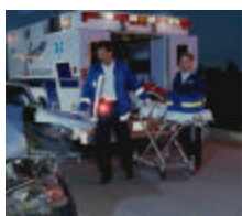
EMT & Fire Rescue

y Alternating high intensity colored LED's in a 360° pattern y Three user selectable lighting modes; 1st mode - dual flashing colors; 2nd & 3rd modes: each color is selected individually for "constant on" illumination y Length: 7.9 inches long y Weight: 6.6 ounces y Visual indicator for low battery y High impact ABS case sealed with water tight gaskets y Includes: Lanyard, Belt Holster, 9V Alkaline Battery and Vehicle Mounting Kit y 2 year manufacturers warranty (USA only) y Protected by US Design Patent No. D410,399