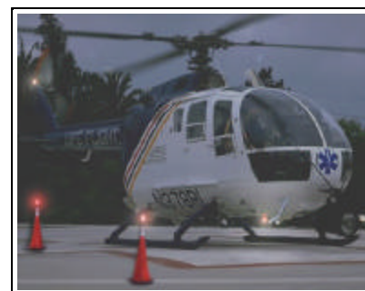
Mark helicopter landing sites with the ICE Light

Voice: (561) 790-0111 Fax: (561) 790-0080 E-mail: info@torfino.com Web: www.torfino.com