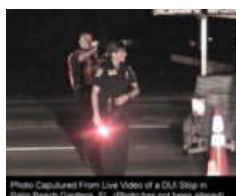
D.U.I. Check points